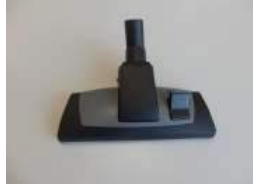
DE LUXE FLOOR TOOL