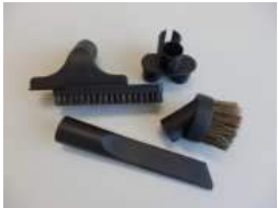
4 PCE ATTACHMENT SET