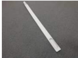
LONG CREVICE TOOL