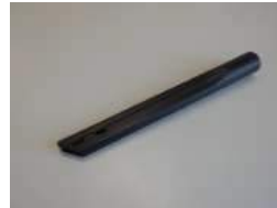
MEDIUM CREVICE TOOL