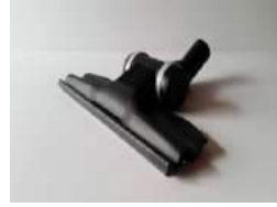
LOW PROFILE FLOOR TOOL