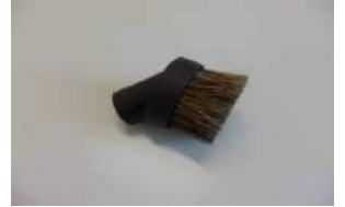
ROUND DUST BRUSH