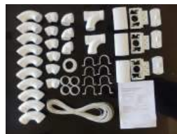
DIY INSTALL KIT