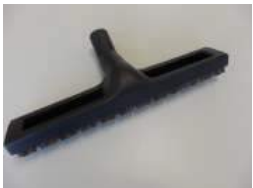
HARD FLOOR BRUSH