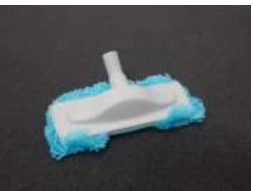
MICROFIBRE DUST MOP