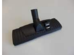
STANDARD FLOOR TOOL