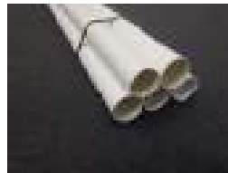
VACUUM PIPE 50MM